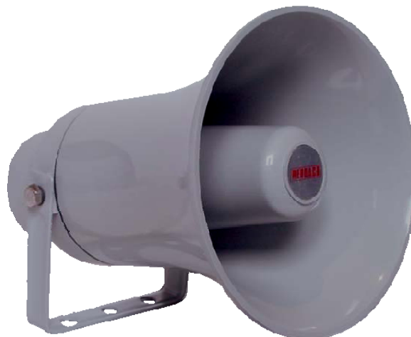
C2053 10W Horn Speaker