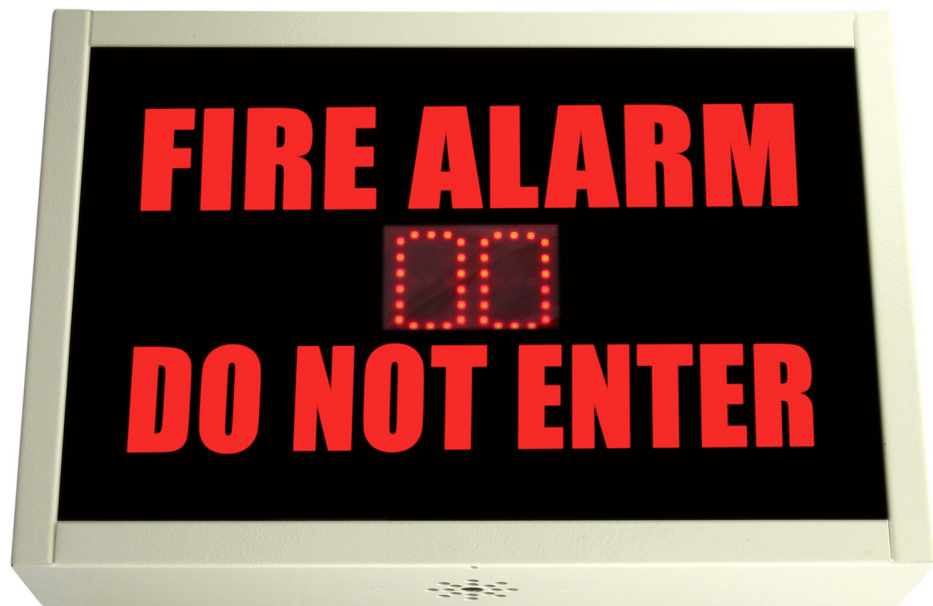
AVS-C and AVDC-FDNE