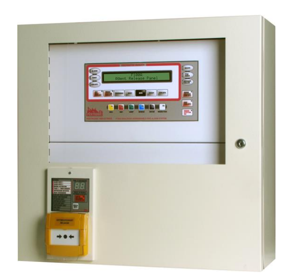
Extinguishing Agent Release System Panel

Extinguishing Agent Release Signage with fully configurable messages, visual options and an optional 'Time to Discharge' display, complement the product range providing unique, yet comprehensive solutions for all Extinguishing Agent requirements.