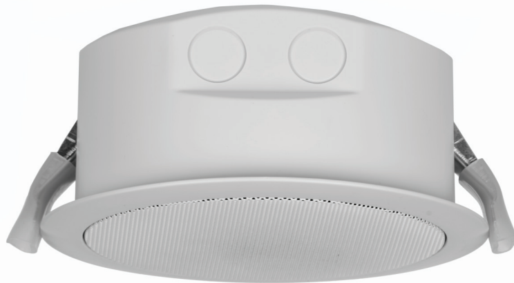
4-Inch Ceiling Speaker, 6W, White (L-VCP06D-W)

To ensure compatibility with commonly-used fire evacuation systems, these speakers incorporate series blocking capacitors and 100 Vrms line transformers.