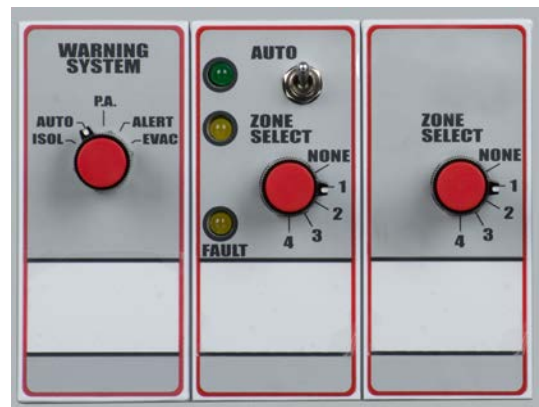
Warning System Control Unit, Evac Zone Select Master Unit & Evac Zone Select Slave Unit

The Warning System Control, Evac Zone Select Master Unit and Slave Units are fully compatible with Pertronic Analogue Addressable Fire Alarm Systems F220, F120A and F100A.