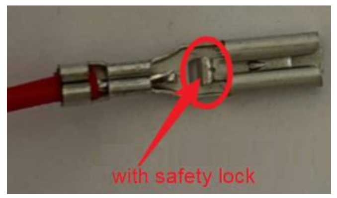
Tap connector with safety spring lock

Squeeze the safety lock with finger and thumb to unlock the connector. If necessary, use needle-nose pliers to squeeze the safety lock.